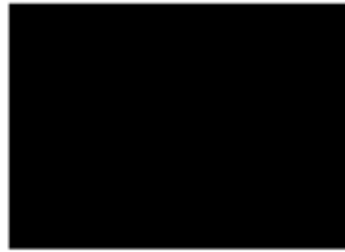
Fiscal Court Parking Lot

Parking also available along Jefferson, Cedar (east of Walnut) and Washington (south of Main and east of 53)