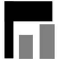
Public Parking Behind 208 and 210 East Main